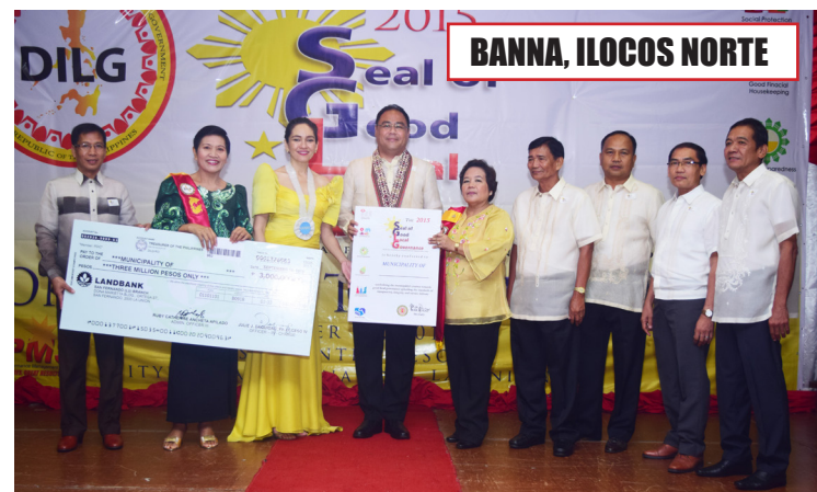
BANNA, ILOCOS NORTE