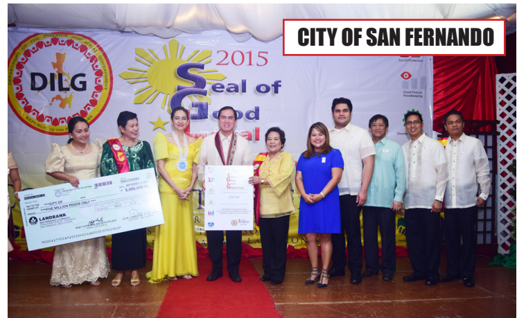
CITY OF SAN FERNANDO