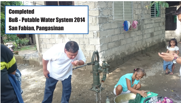
Completed BuB - Potable Water System 2014 San Fabian, Pangasinan