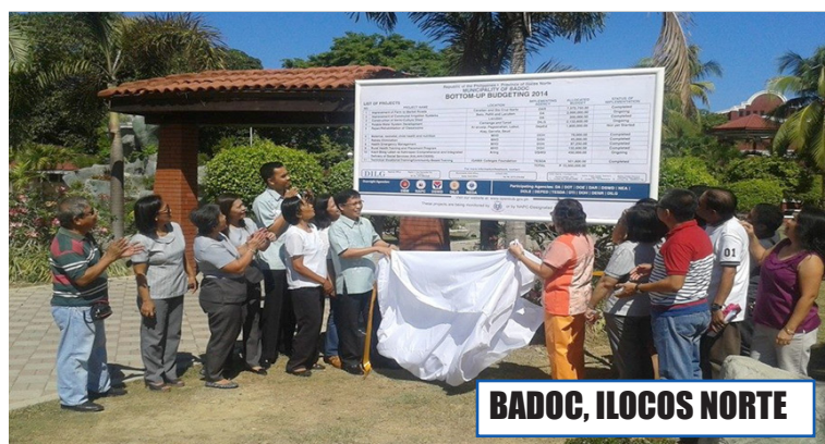
BADOC, ILOCOS NORTE

City of San Fernando, La Union – To ensure transparency and set out accountability in the use of public funds, the Department of the Interior and Local Government (DILG) Region 1 intensifies its efforts to monitor the 2013-2015 Bottom-Up Budgeting (BuB) projects.