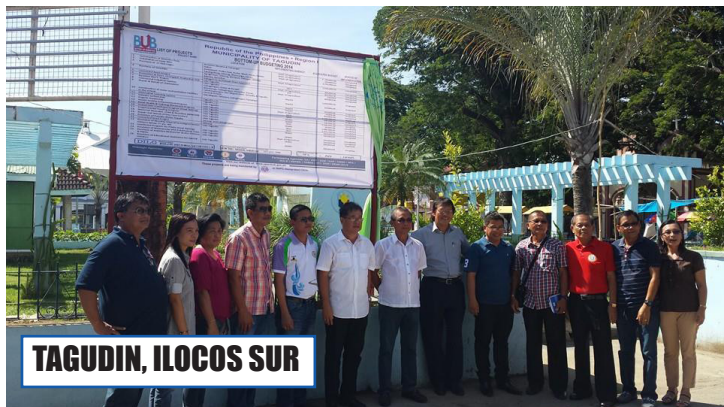
TAGUDIN, ILOCOS SUR