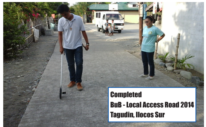
Completed BuB - Local Access Road 2014 Tagudin, Ilocos Sur