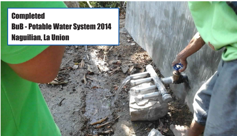
Completed BuB - Potable Water System 2014 Naguilian, La Union