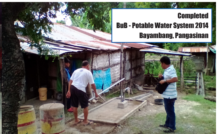
Completed BuB - Potable Water System 2014 Bayambang, Pangasinan