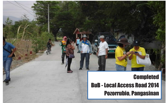
Completed BuB - Local Access Road 2014 Pozorrubio, Pangasinan